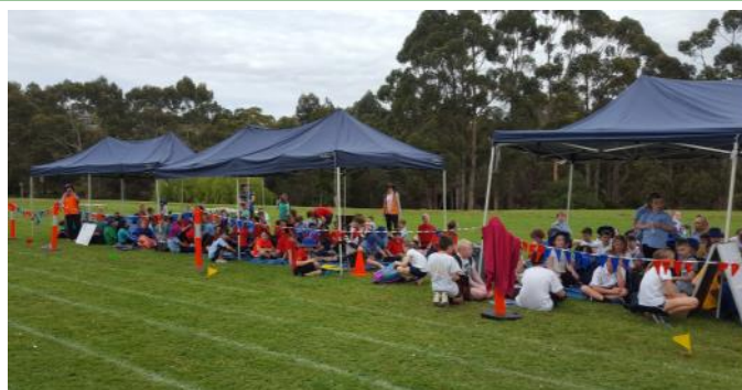
Seated under cover waiting for their events