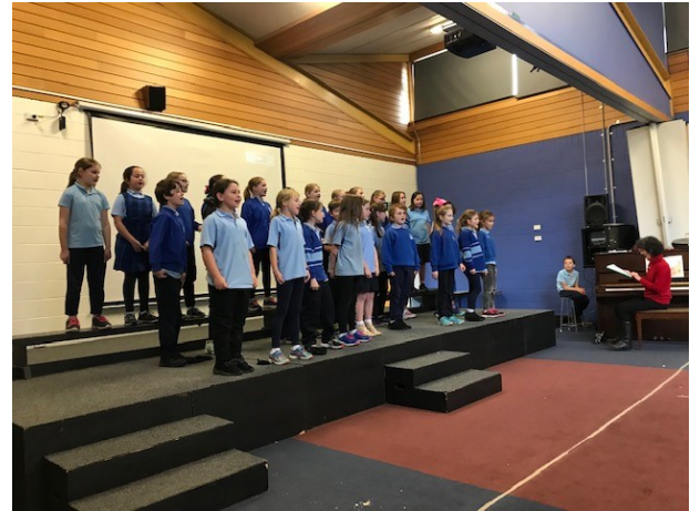
Primary Choir loves singing and performing