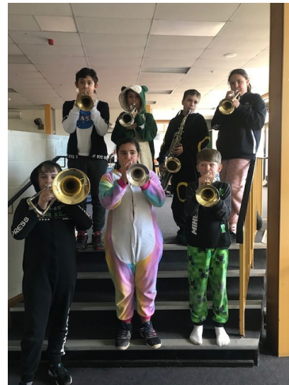
Brass practice today in their pyjamas for 'Pyjama Day'.