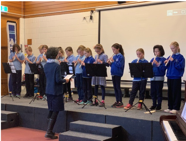
The Recorder Group played in Assembly this week. They must be practising hard because they are sounding great.