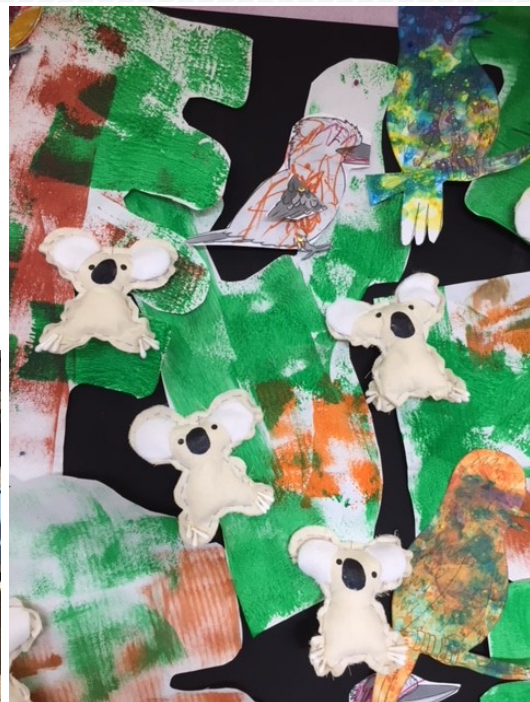
Hand sewn Koalas.